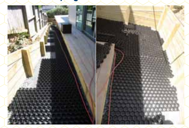
Step 1: Ground prepared and leveled with Gap7 aggregate used as bedding material