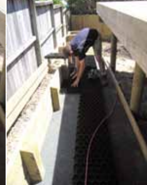
Step 2: Fast and easy to lay with power or hand saws able to cut JakMatEnviro