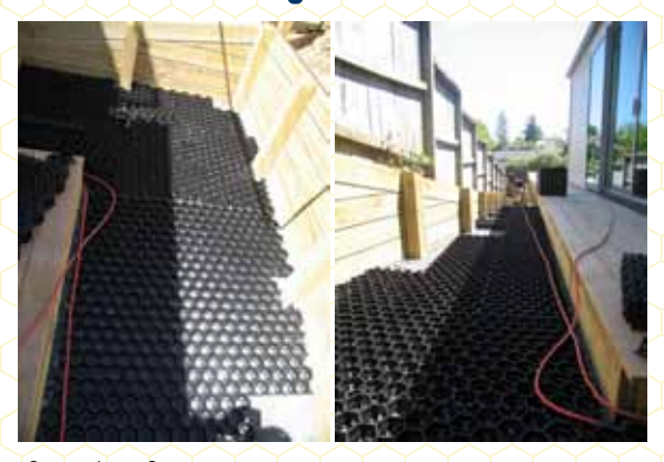
Step 4: Irish Gold used as decorative aggregate to fill honey combed cells of JakMatEnviro