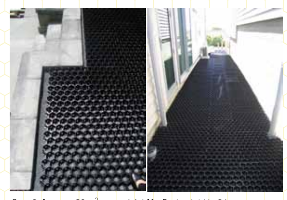
Step 3: Approx. 60m<sup>2</sup> area of JakMatEnviro laid in 3 hours